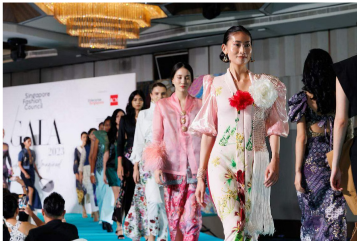
This year's theme of "Singapore Story" is "Kabaya Re-imagined", and there are more than 30 final works for guests to vote on. (Courtesy of Singapore Fashion Council)

The theme of this year's Fashion Design Award is "Kabaya Re-imagined", inviting local designers to inject new imagination and interpretation into this charming traditional costume in Southeast Asia.